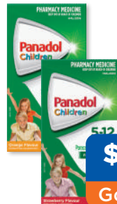
Panadol Children 5 - 12 Years 200mL*