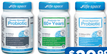
Life-Space Double Strength Probiotic 30 Capsules, Probiotic for 60+ Years or Broad Spectrum Probiotic 60 Capsules*