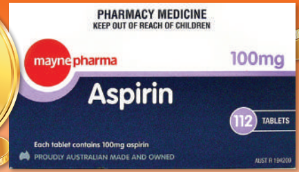
Mayne Pharma Aspirin 112 Tablets* Good Price*