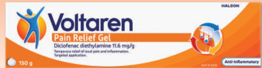
Voltaren Pain Relief Gel 150g*