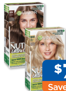
Garnier Nutrisse Crème Hair Colour